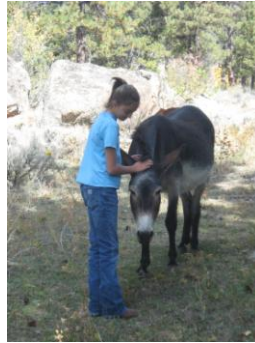
Give 'em a little love