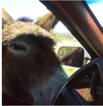
Begging donkey in your own backyard